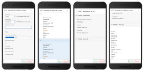
Figure 3 – purchase order approval screen

Intuitive approval screens then display a summary of relevant data, for more efficient, faster, better-informed decision-making, at the click of a button.